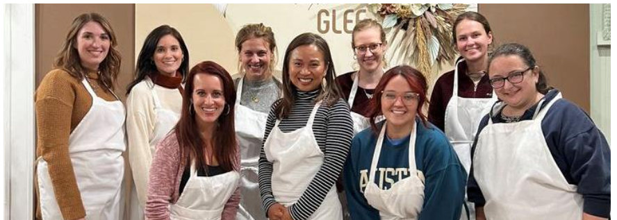
Young adult women's community group gathered to showcase their creativity in candle making.

Our newest round of Community Groups – small group who gather to apply the Bible to their lives, pray and build relationships – launched in September. Seven groups are off and going. If you are interested in joining one, contact the church office for more information about open groups.